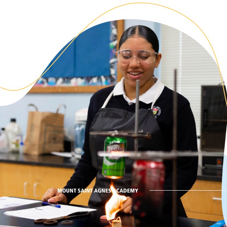
MOUNT SAINT AGNES ACADEMY