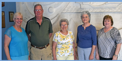
Class of 1972 at their 45th Reunion

Classes of 1960 & 1961 on a Bermuda Visit