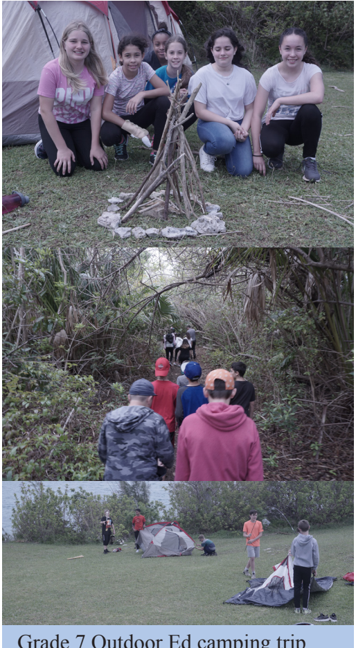
Grade 7 Outdoor Ed camping trip