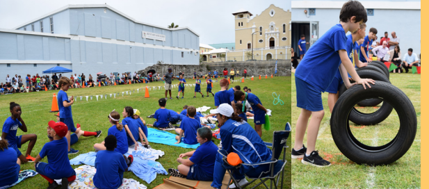
Elementary Sports Day